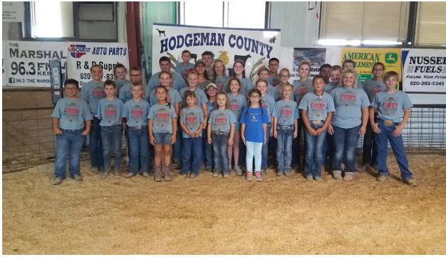
Thank you Victory Electric for sponsoring the 2018 Fair Shirts

Next 4-H Council Meeting Monday, November 26, 2018 6:30 pm Location To Be Announced Tentative Officer Training